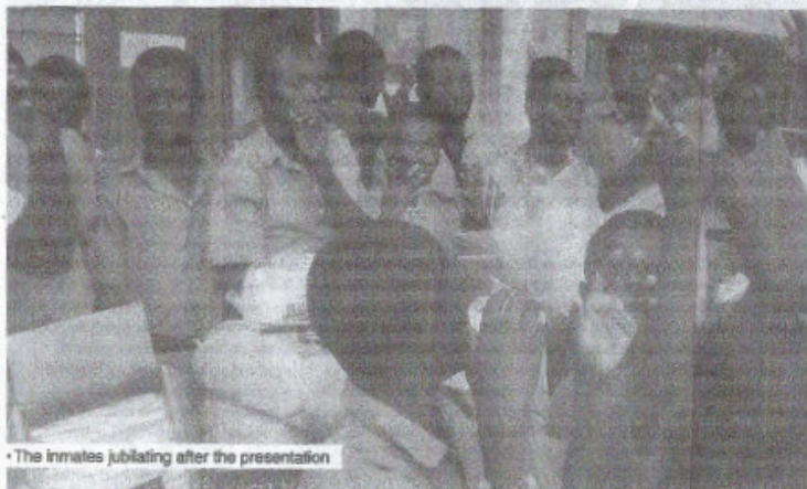
The inmates jubilating after the presentation