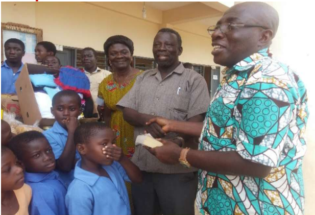
The School of Deaf and Dumb.